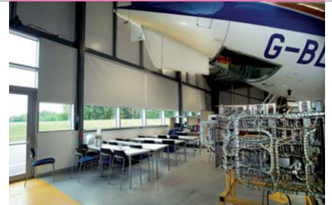
Kampus blinds at a Manchester FE College.